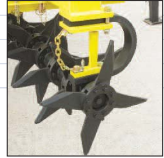
C-Flex with Outboard Star Design