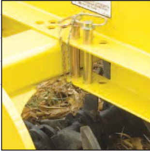
Quick Adjust Swing Arms