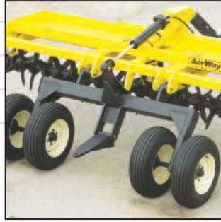
Optional Pull Type Wheel Kit