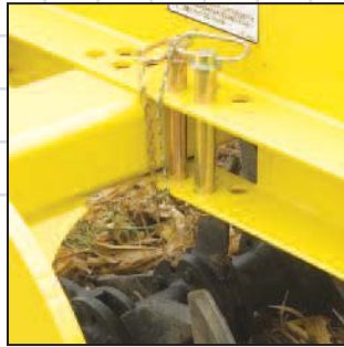
Quick Adjust Swing Arms