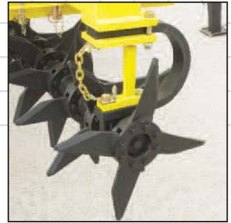
C-Flex with Outboard Star Design