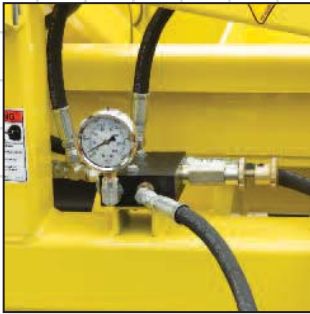
Wing Down Pressure Valve