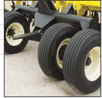
Optional Pull Type Wheel Kit