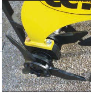
Heavy Duty Bearings