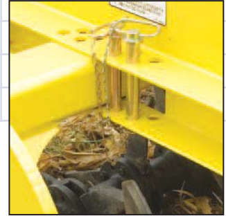
Quick Adjust Swing Arms