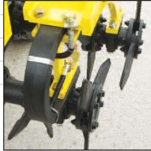
C-Flex with Outboard Star Design