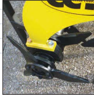
Heavy Duty Bearings