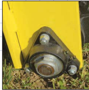
Heavy Duty Bearings