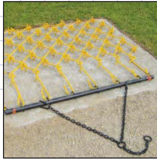
5/8" Diameter Chain Harrow