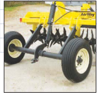
Optional Pull Type Wheel Kit